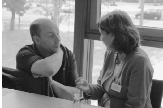
Picture 3. Participants getting to know each other.