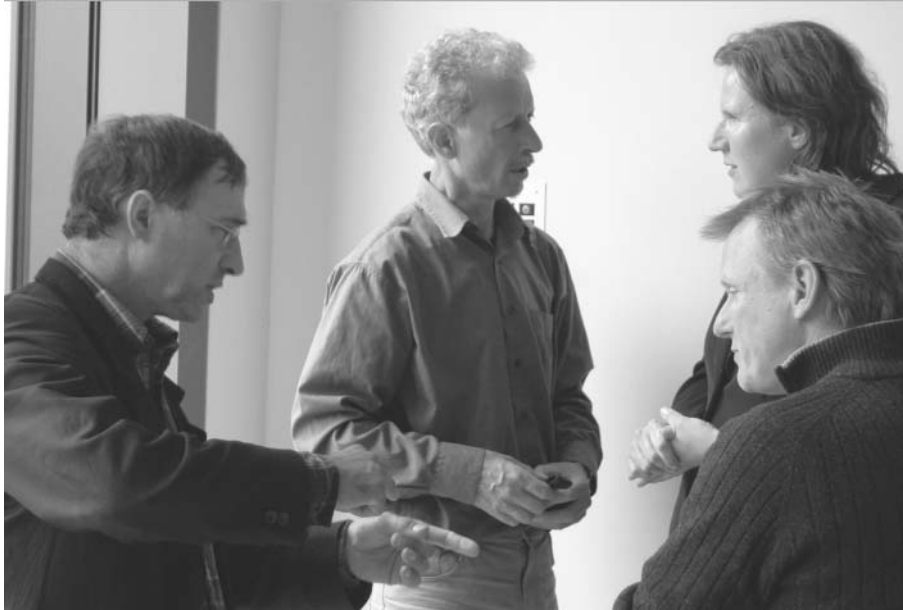
Picture 1. Participants discussing social farming in the break.