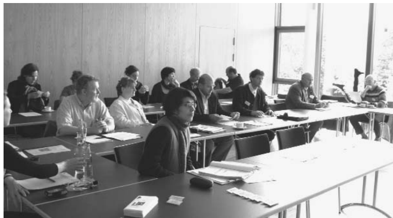
Picture 2. Participants in plenary.